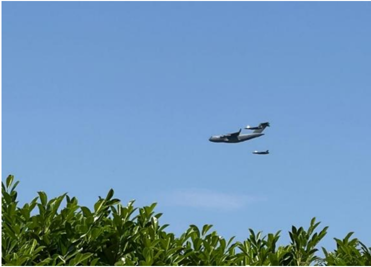
taken from my garden. 14.6.2025