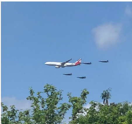
Photo Courtesy of Suzanne Bolwell-Davies taken from my garden. 2.6.2022